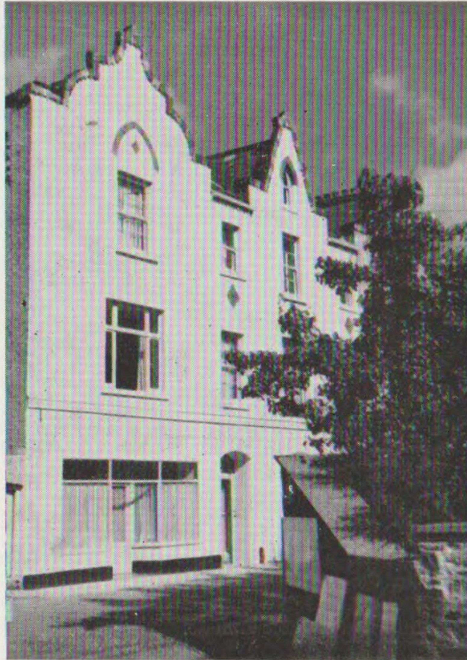
"THE MAGDALA CENTRE"