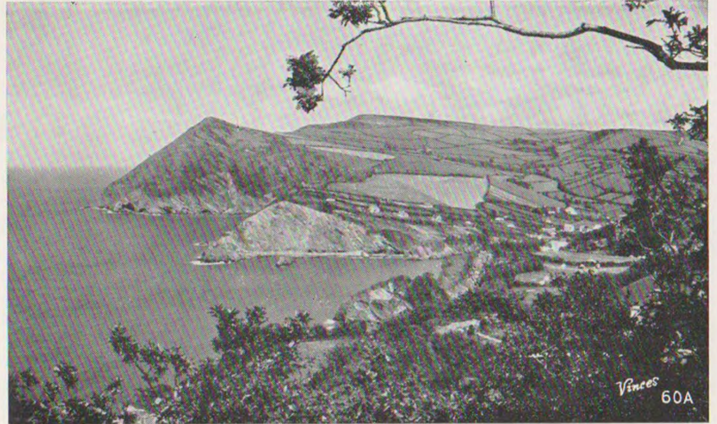
Combe Martin Bay and Hangman Hills

COMBE MARTIN is situated amid the finest scenery in the British Isles, on the Southern shore of the Bristol Channel, in the county of Devon. It lies in a deep combe, or valley, and thus sheltered from all cold winds, enjoys a mild and equable climate.